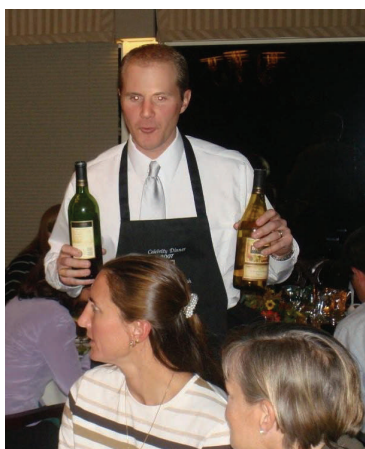
Olympic gold medalist Casey FitzRandolph supported the Dinner this year as a waiter and silent auction donor.

American TV Attainment Company Coldwell Banker Sveum Realtors Gingras, Cates & Luebke, S.C. Gorman & Company, Inc.