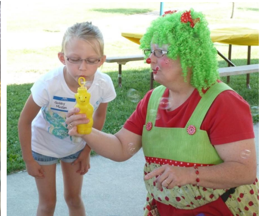
Ladybug the clown

The weather was beautiful on Saturday, August 27, when over 300 people assembled at McKee Farms Park in Fitchburg for our annual picnic. It was another really fun day. In addition to our regular entertainment of fire truck rides, face painting, tattoos, bubbles, and the accessible playground, this year we were joined by Ladybug the clown and the Mallards Mascot. There was a wonderful array of food, drinks, and desserts. 10 lucky people won door prizes thanks to the Allison Smith Foundation and many more enjoyed participation in our raffle drawing. Big thanks to all of the staff, Board members, significant others, and volunteers who helped make this event successful. Food was again donated by Gaylord Catering, Schoep's Ice Cream, and Miller's Market in Verona.