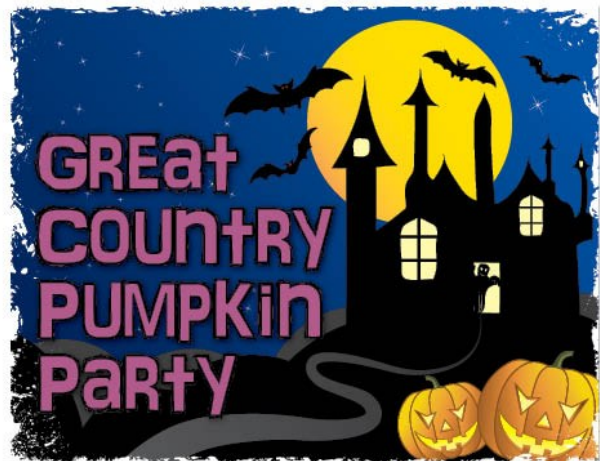
A Halloween celebration for children with special needs and their families

For more information contact Katy Barnum at 608-821-3119 or kbarnum@ccmadison.org