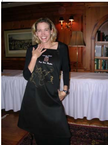
Suzy's fun-loving personality came through on her signature apron which was one of over 150 items featured in the silent auction.